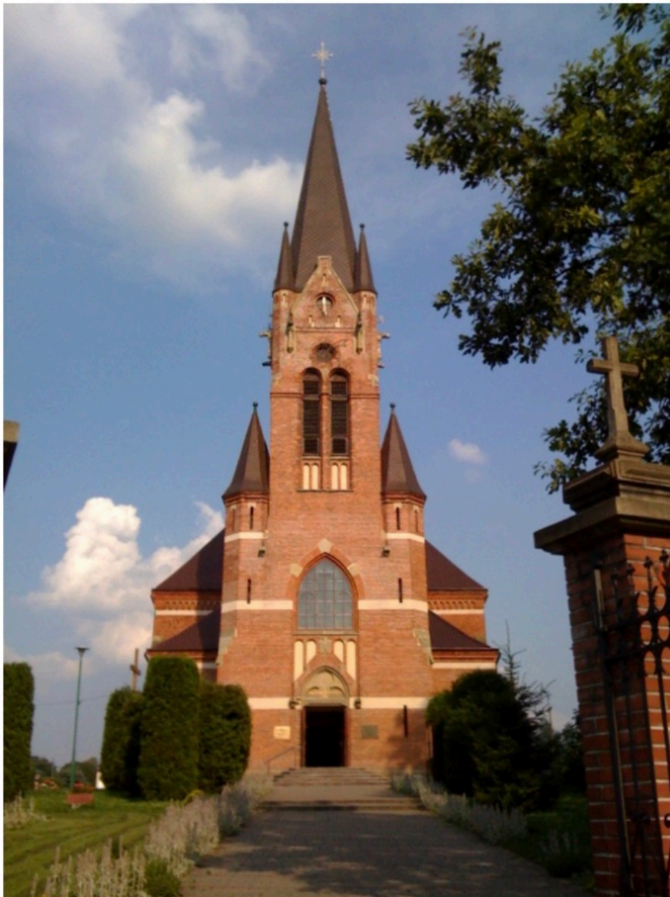
Present-day Catholic Church in Osobnica Parafia pw. św. Stanisława BM w Osobnicy